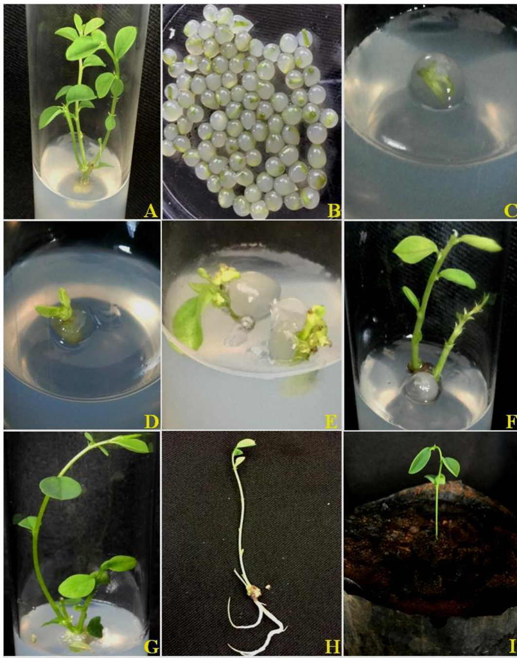
Fig. 2: Plantlet regeneration from encapsulated Shoot tips of C. collinus . (A) In vitro raised plant used for encapsulation; (B) Encapsulated shoot tips in calcium alginate beads; (C) Culture of stored beads (4 o C) in MS medium supplemented with 1.0 mg/l BAP; (D&E) Emergence of shoot from encapsulated shoot tips; (F&G) Multiple shoot re-growth from encapsulated beads; (H) Plantlet with well-developed roots in 0.5 mg/l IAA; (I) Acclimatized plantlets from encapsulated shoot tips.