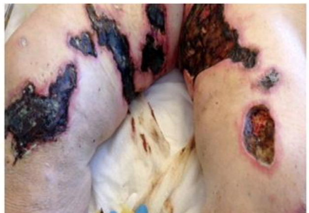
Figure 1: Early ischemic changes with livedo reticularis that later progressed to advanced ischemic necrosis, seen as stage IV ulcers and eschar formation.

Ischemic myopathy, presenting as painful proximal muscle weakness, is a less frequent manifestation that can occur without skin necrosis.[2,9]