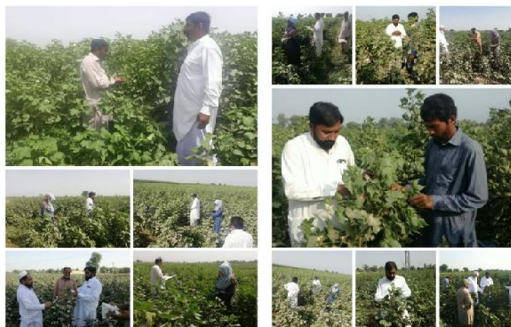
Picture-1 showing collection of data of whitefly at District Lodhran