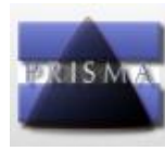
PRISMA 2009 Flow Diagram

had no complete text, and 7 had low quality and could not be considered in the research. (Figure 1).